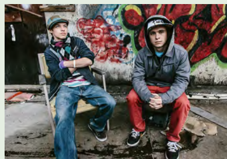
See SugarBeats and a dozen other artists at the 2015 Willamette Valley Music Festival