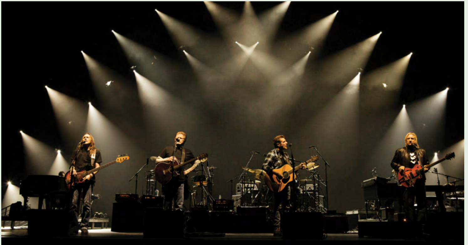
See The Eagles in concert at Matthew Knight Arena, May 28